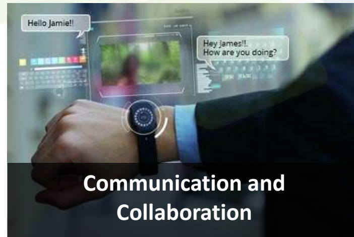
Communication and Collaboration